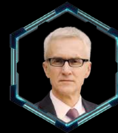
Jürgen Stock Secretary General, INTERPOL