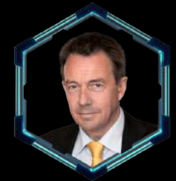
Peter Maurer President, International Committee of the Red Cross (2012–2022)

A live session with the International Space Station to commemorate the 60th anniversary of the first manned flight to space.